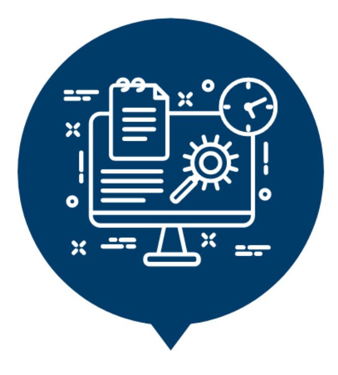
Learning Design Sprints